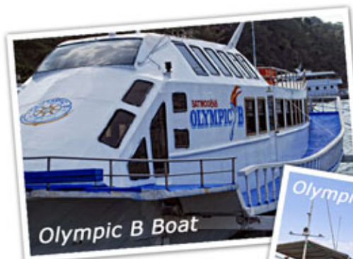
Olympic B Boat

Telephone: (043) 417-4164 Cellphone: 0917-505-1478